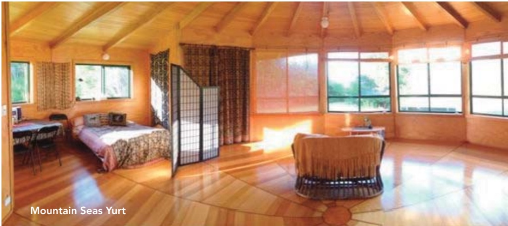
Mountain Seas Yurt