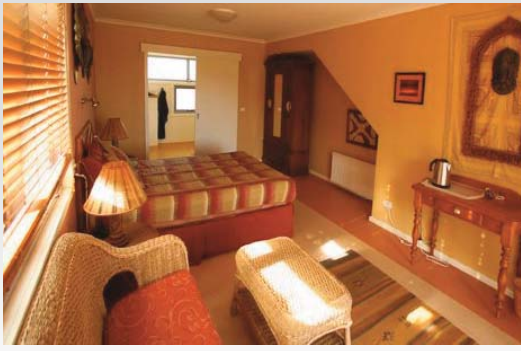
Mountain Seas Retreat accommodation